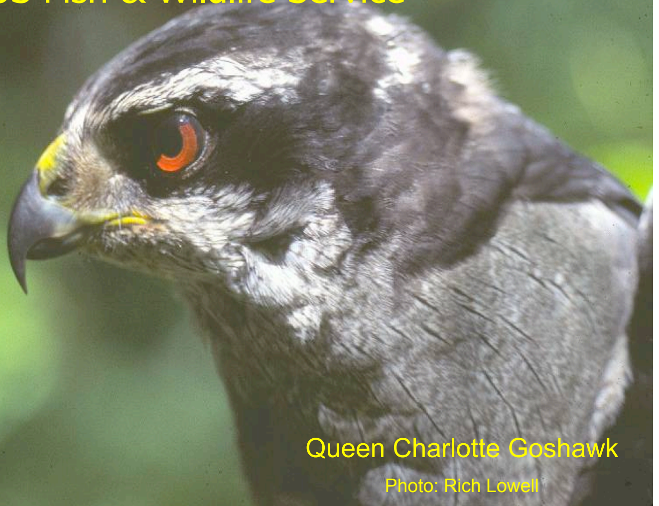
Queen Charlotte Goshawk